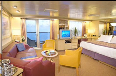
Full Suite - $3,199