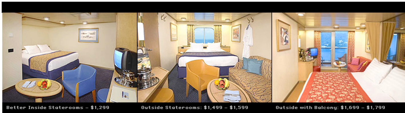
Better Inside Staterooms - $1,299