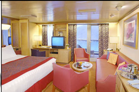
Superior Suite - $2,099