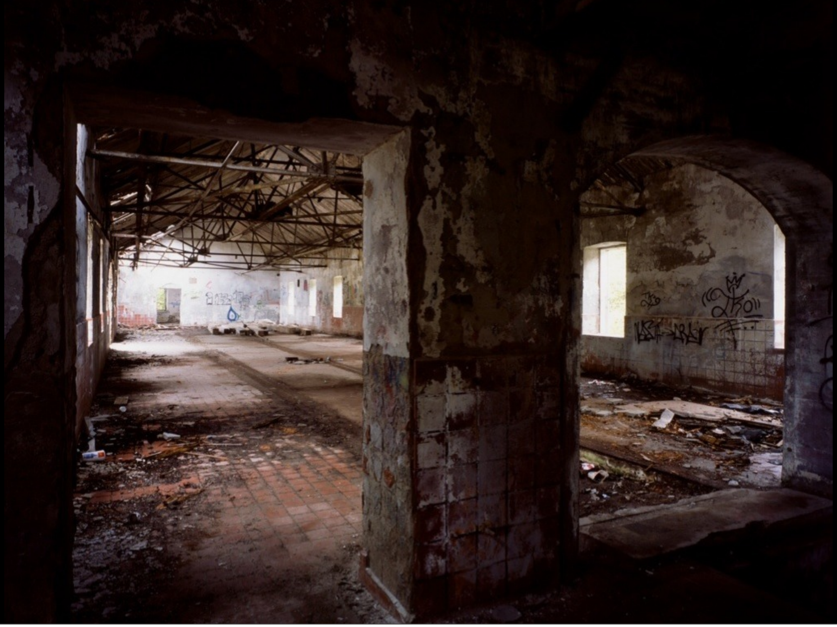
Friday, April 20, 12