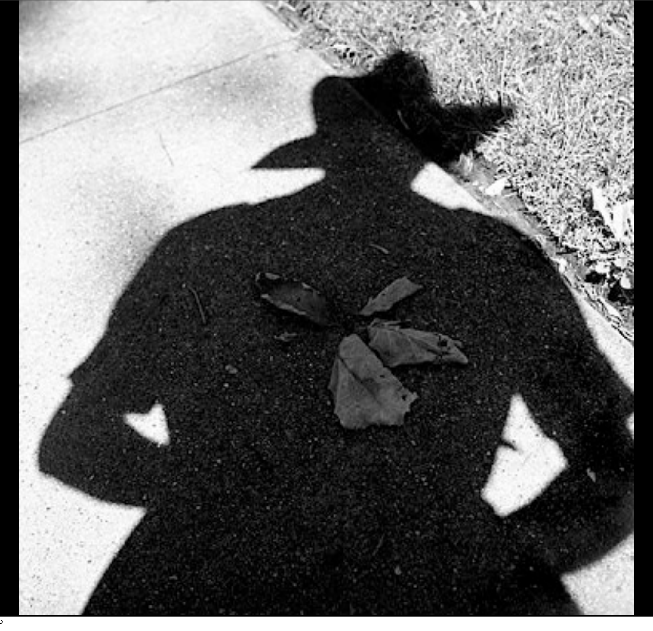
Friday, April 20, 12