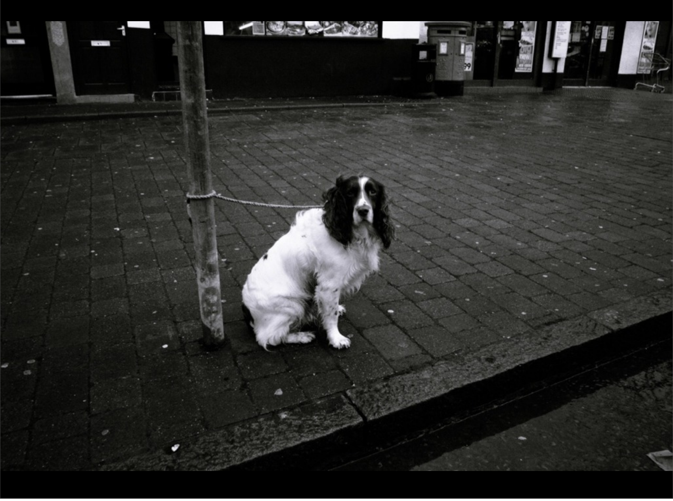
Friday, April 20, 12