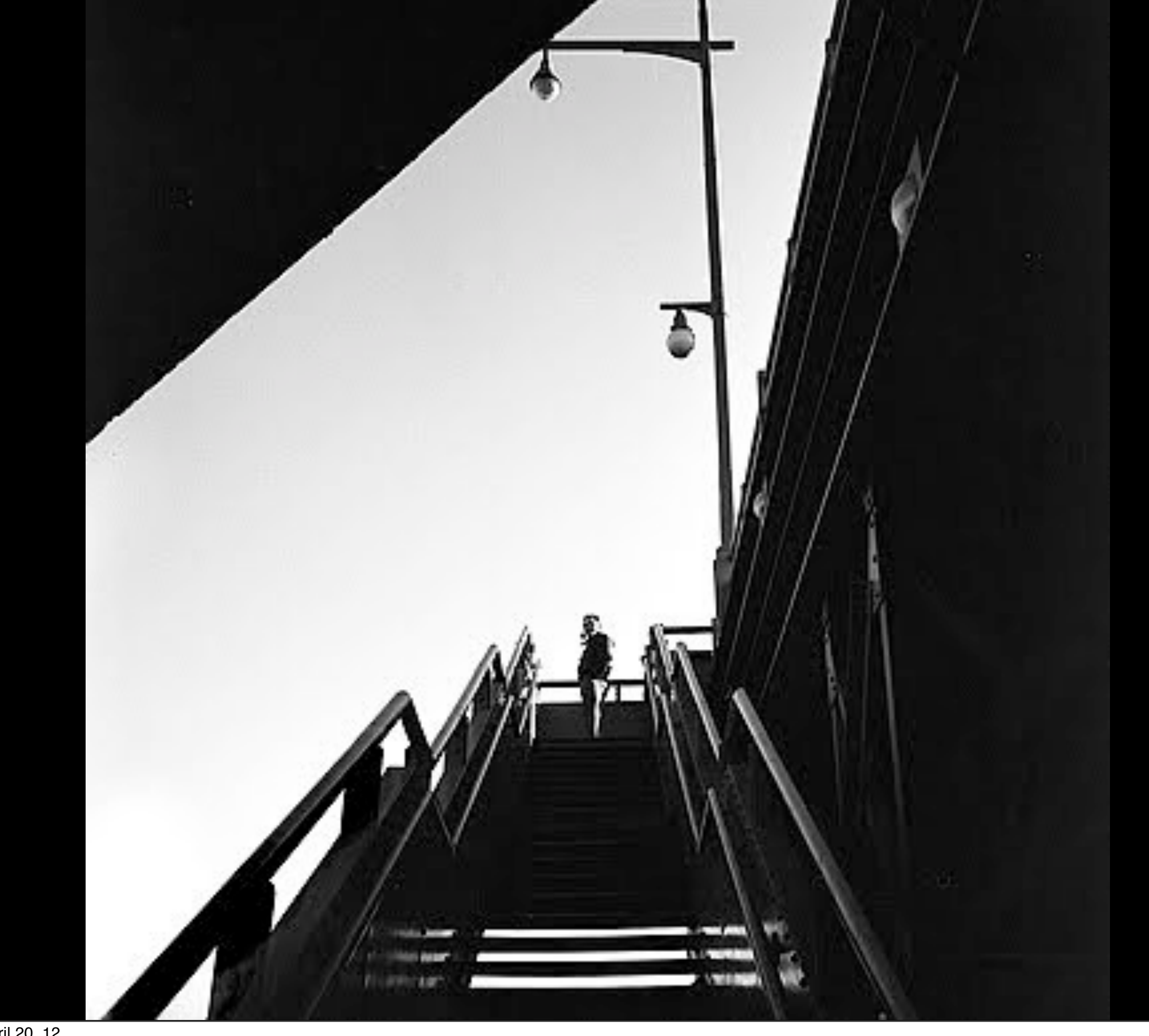
Friday, April 20, 12