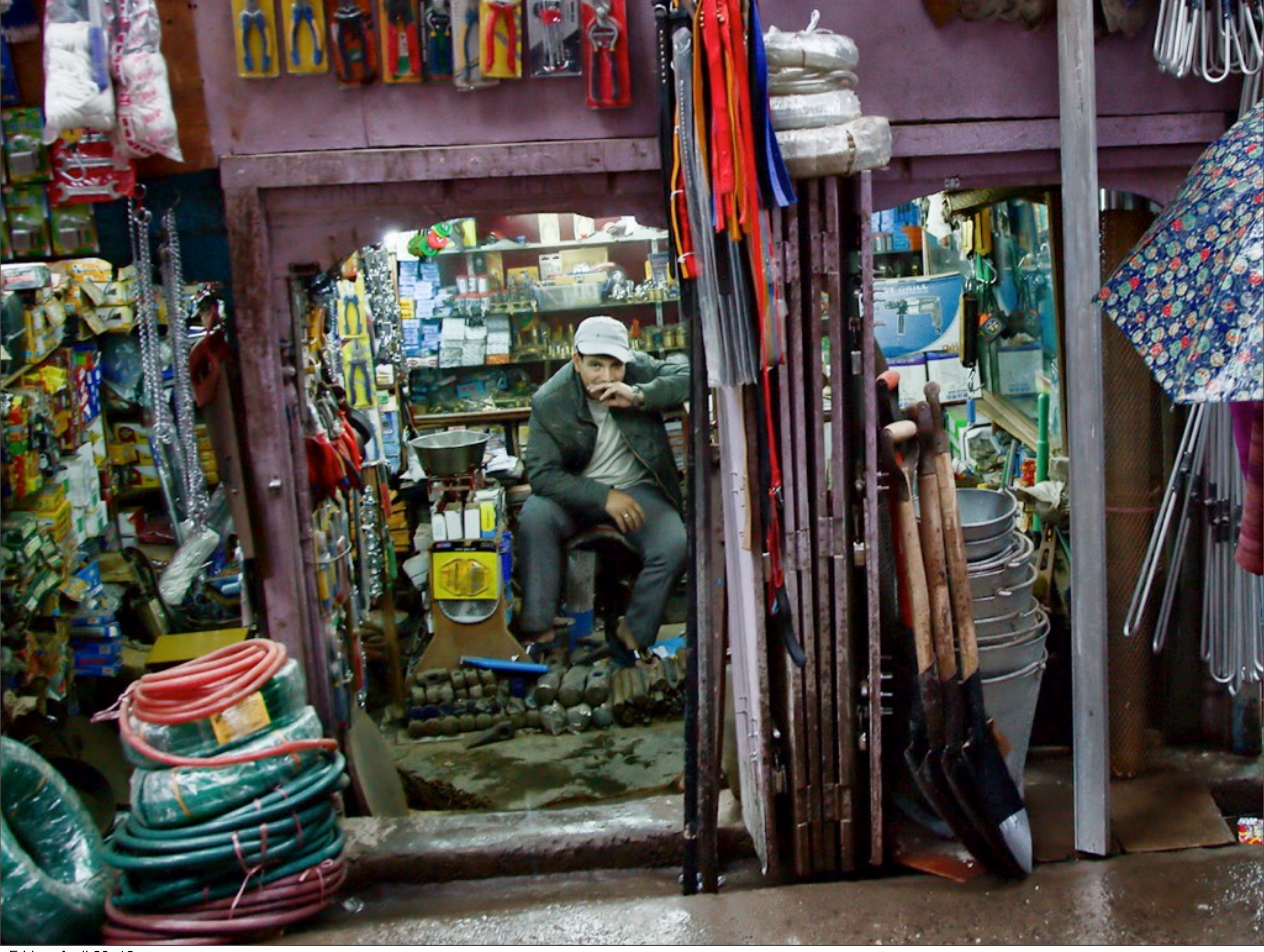
Friday, April 20, 12