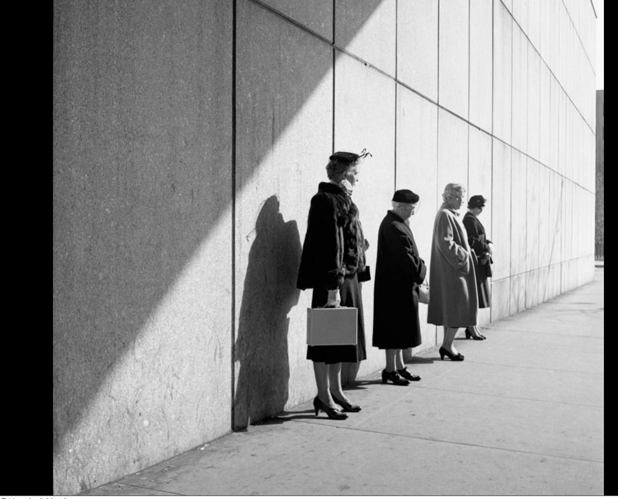
Friday, April 20, 12