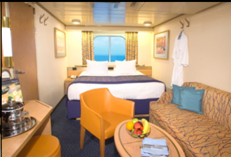
Ocean View: $1,249 – $1,399