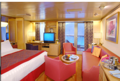
Superior Suite: $1,899