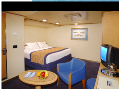
Interior: $999 – $1,049