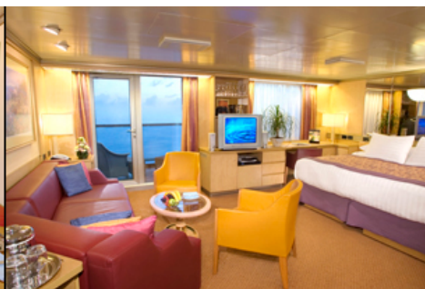
Deluxe Suite: $2,749