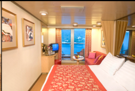
Verandah: $1,629 – $1,799