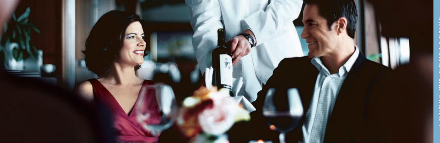
Elegant dining, fine wines

Whatever your special needs — an accessible transfer from the airport to the pier, help selecting shore excursions, a massage in the privacy of your stateroom — expect to be cared for completely.