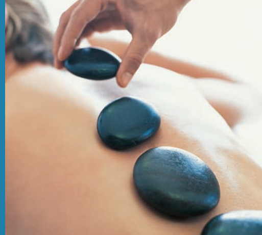
Hot stone massage