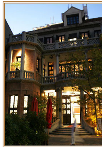
French Concession Mansion