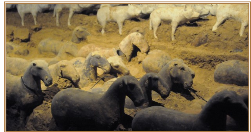
Yangling Museum, Xi'an