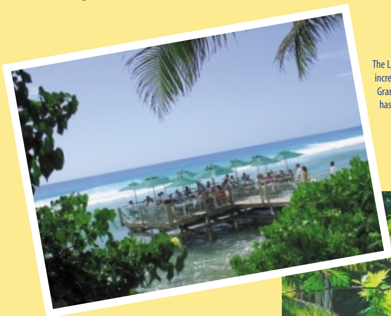
The Lighthouse at Breakers — an incredible Italian restaurant on Grand Cayman island. Every dish has a Caribbean accent!

Escape from routine, regiment, and restriction. Enter a world where the dazzling Caribbean, warm sun, and cool breezes beckon you with an array of adventures and delights.