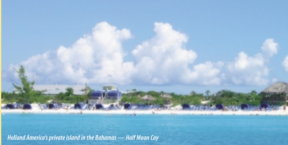
Holland America's private island in the Bahamas — Half Moon Cay

It's 82 degrees, not a cloud in sight. Trade winds blow gently across turquoise seas as your cruise ship anchors off a Caribbean paradise. You've spent the last few hours in a productive and satisfying seminar. Now you're minutes away from windsurfing over rippling waves or swimming in some of the clearest waters you've ever seen.